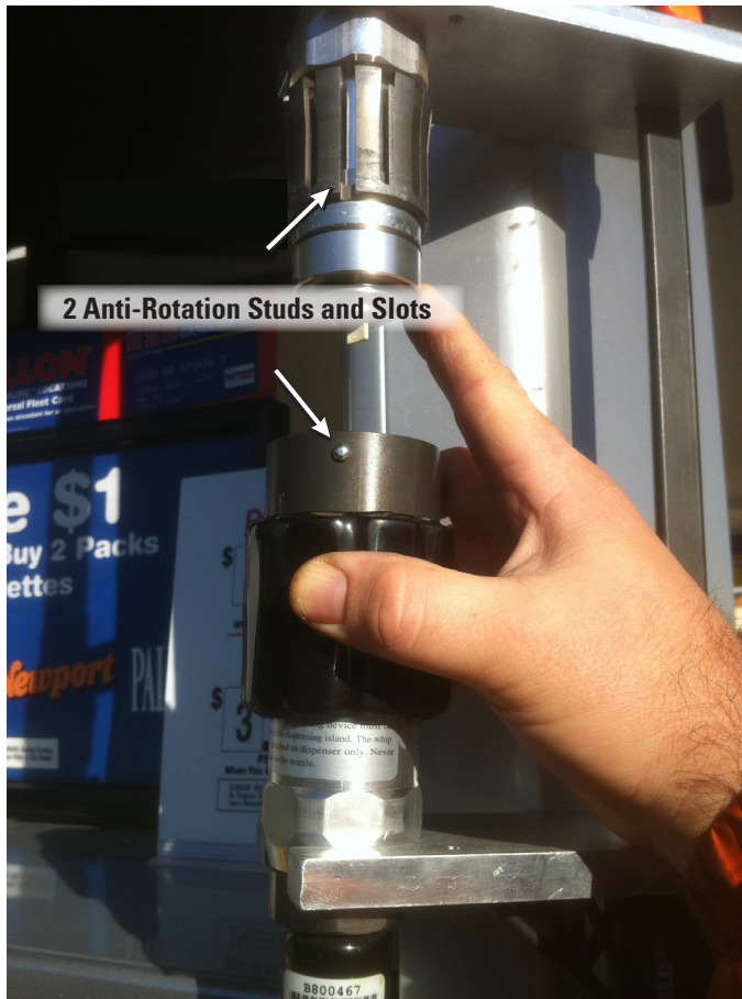
Figure 3. Anti-Rotation Studs and Slots