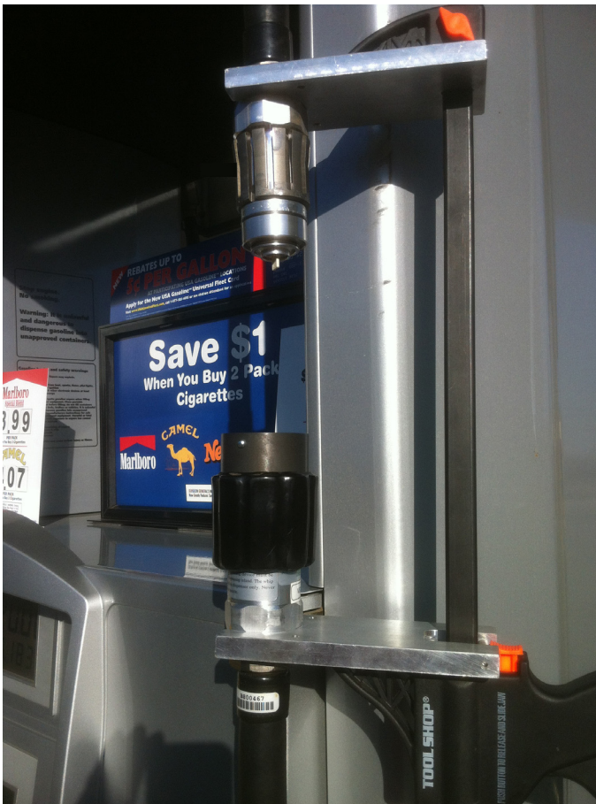
Figure 2. VST Breakaway Assembly Tool