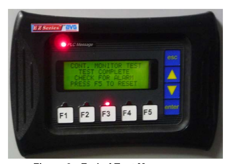
Figure 8: End of Test Message