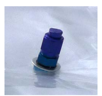
Figure 3: Large Cap with Flare Fitting