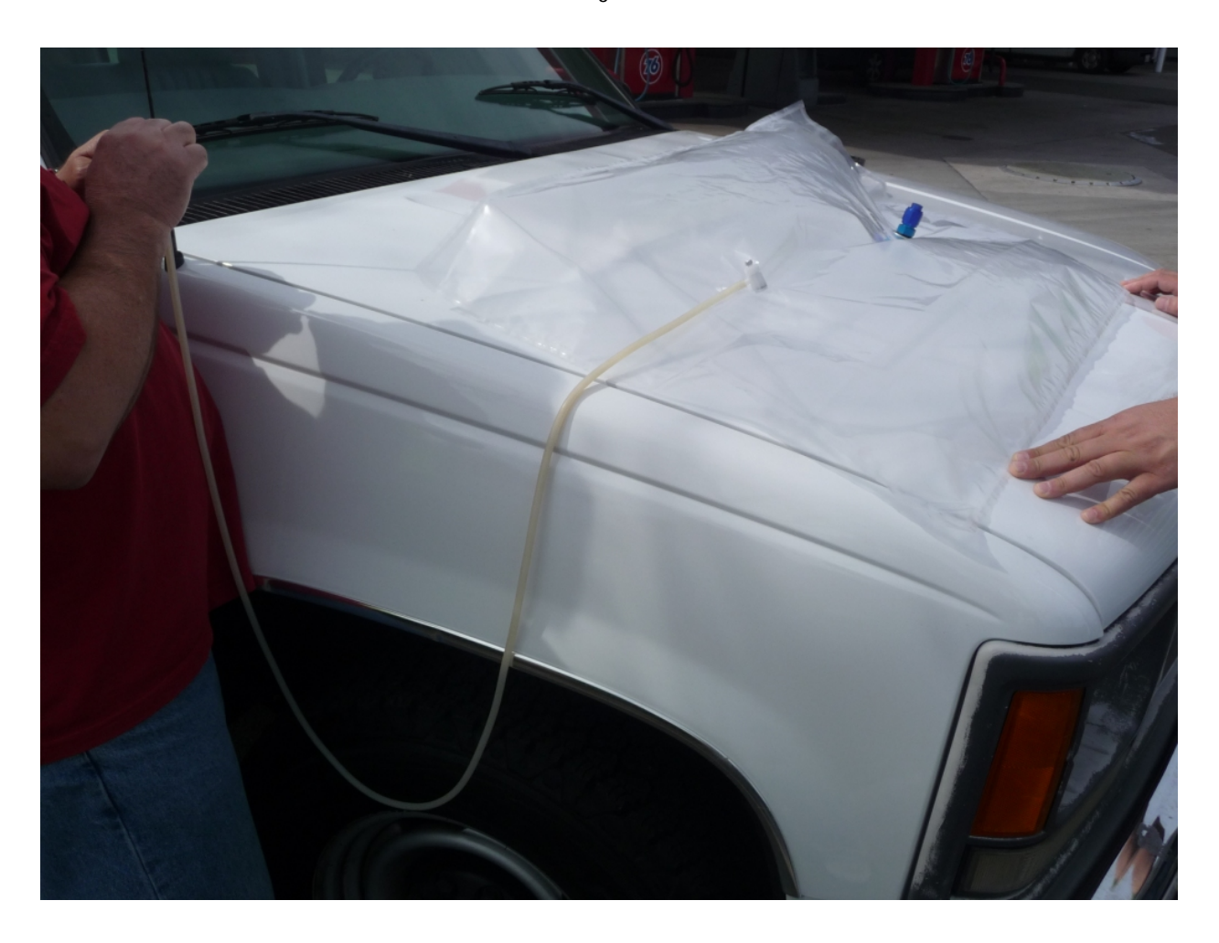
Figure 2: Tedlar Bag Connected to Nitrogen