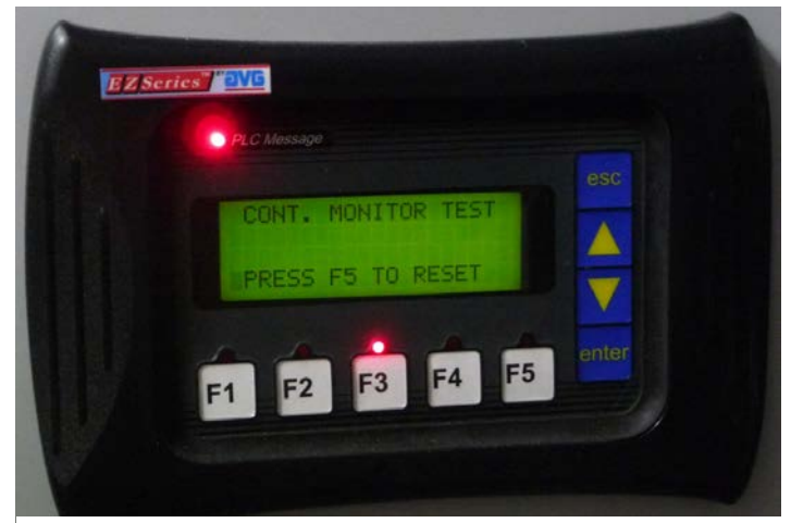
Figure 7: F3 Displays "Cont. Monitor Test"

5.1 Press the F3 button on the VST Green Machine Controller. The panel will display "CONTINUOUS MONITOR TEST". The Green Machine will not go into the RUN mode. After 30 seconds, the VST Green Machine Controller will display "TEST COMPLETE/CHECK FOR ALARM".