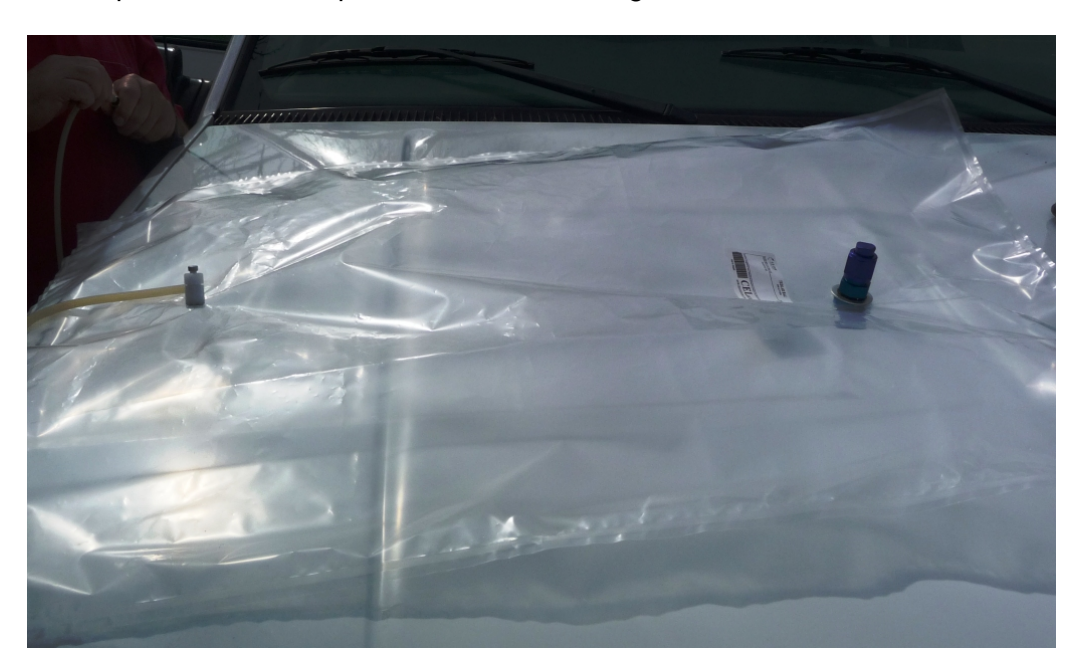
Figure 1: Tedlar Bag with Connections