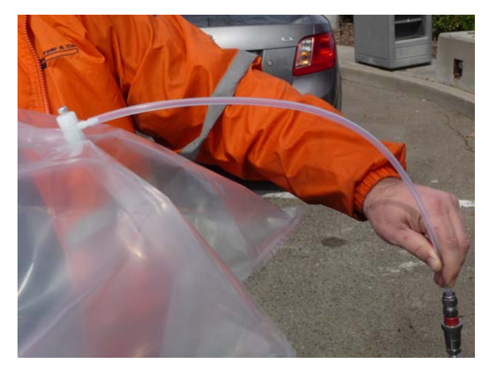
Figure 4: Attach Tedlar Bag to Vacuum Pump to Evacuate the Nitrogen