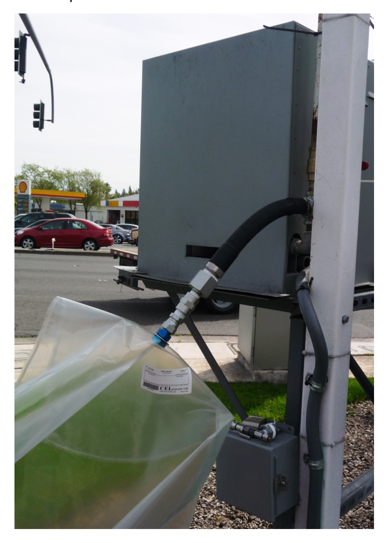
Figure 10: Tedlar Bag attached to Green Machine

5.7 Press F4 on the VST Green Machine Controller. DO NOT PRESS THE F4 BUTTON UNTIL THE BAG IS ATTACHED TO THE GREEN MACHINE AND READY TO COLLECT THE SAMPLE. During the RUN cycle, the Tedlar bag should inflate while the sample is gathered. After the RUN cycle, record the time at the end of the collection in the appropriate place on the form at the end of this procedure. The VST Green Machine will begin the PURGE cycle next. Once in the PURGE cycle, attach the NOVA portable H/C analyzer to the Tedlar bag.