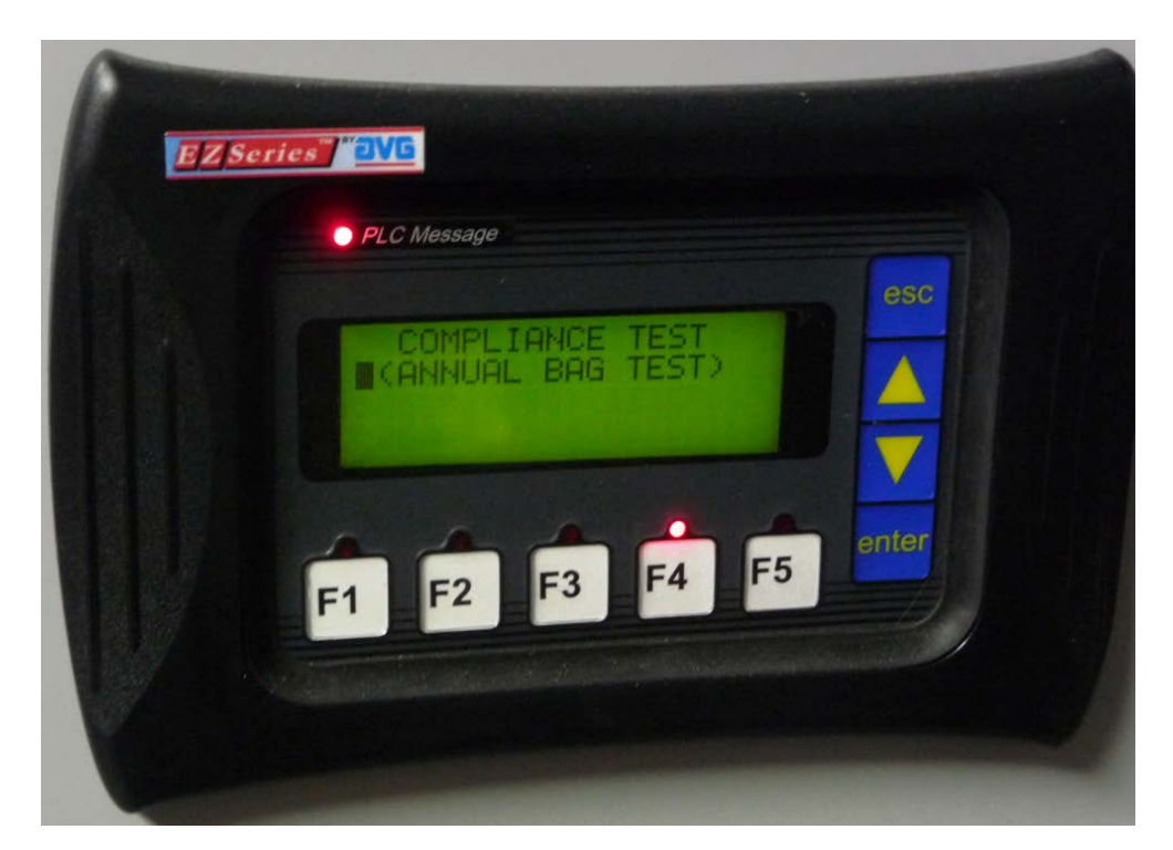
Figure 11: F4 – GM Bag Test