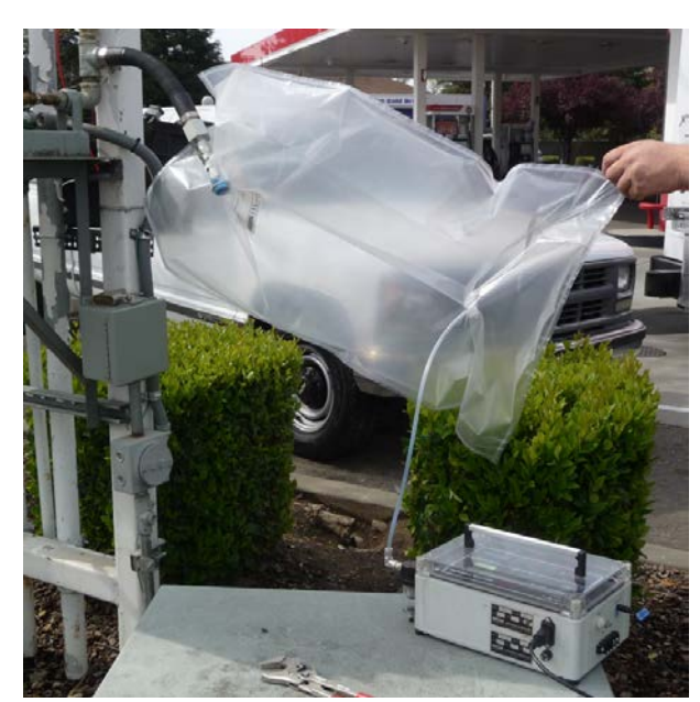
Figure 12: Tedlar Bag attached to the Green Machine and NOVA