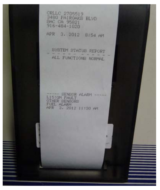
Figure 9: Green Machine Motor Fault TLS-350 Alarm